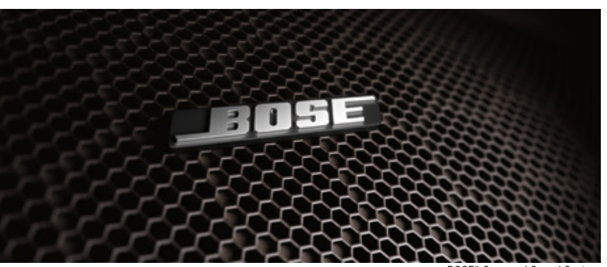
BOSE® Surround Sound System