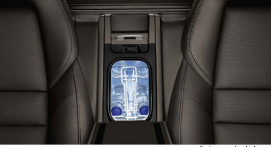
Cooling compartment in the rear