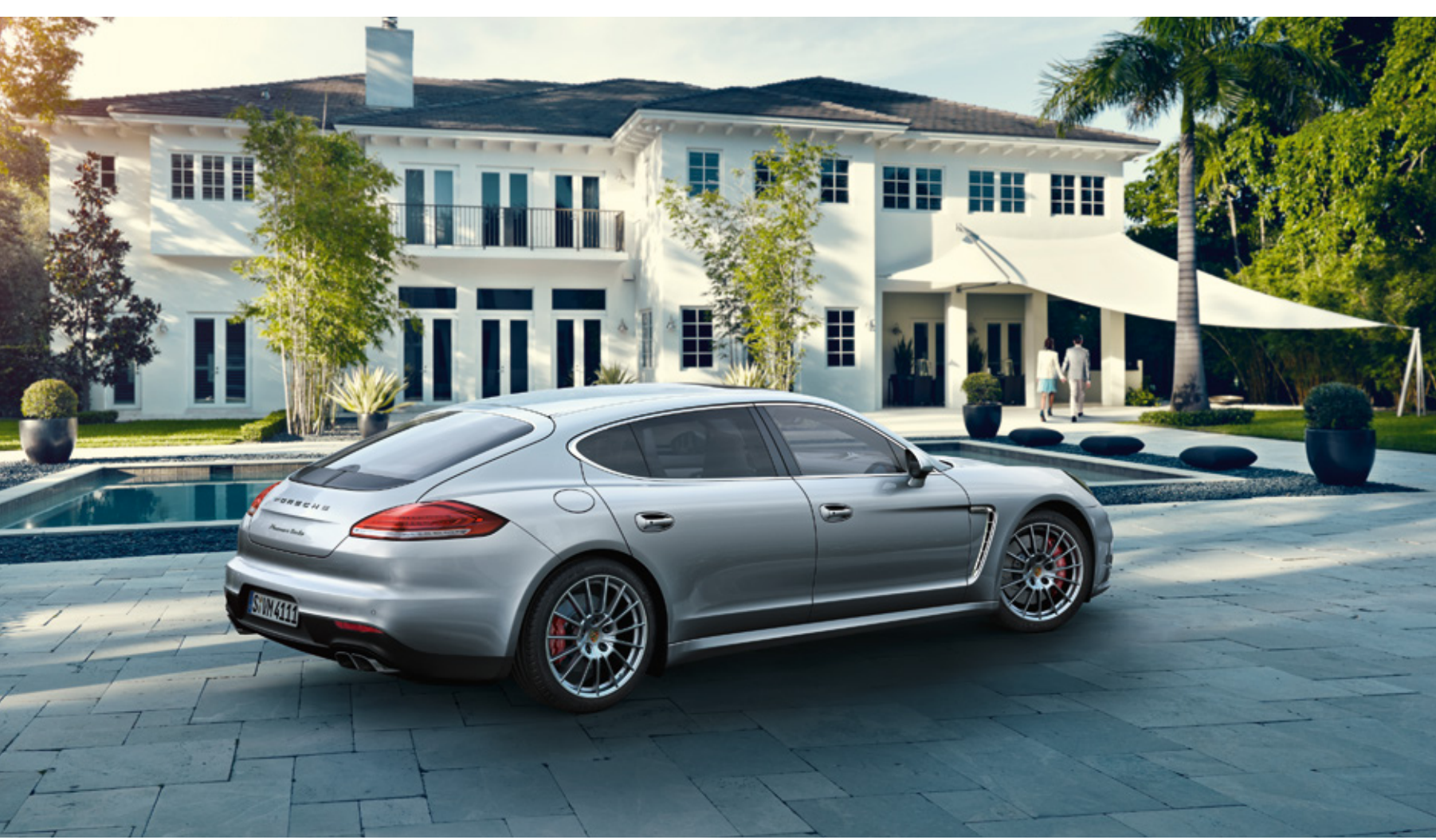
Panamera Turbo Executive with 20-inch Panamera Sport wheels

Your business models always were highly dynamic.