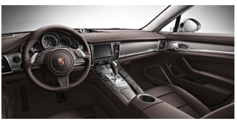
Panamera Turbo Executive interior in Espresso with brushed aluminum interior package

cockpit offers excellent ergonomics thanks to the logical grouping of all the controls. Just as you would expect from a Porsche.