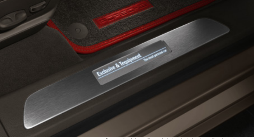
Personalized door sill guards in brushed aluminum, illuminated

At your request, we can make your Panamera Executive model even sportier, even more comfortable and even more individual. We aim to create something truly special and, to be successful, perhaps the most important factor is that we take our time. It is only by observing the utmost care during the consultancy and planning phases and in the selection and crafting of materials that it is possible to design a car that has never been seen