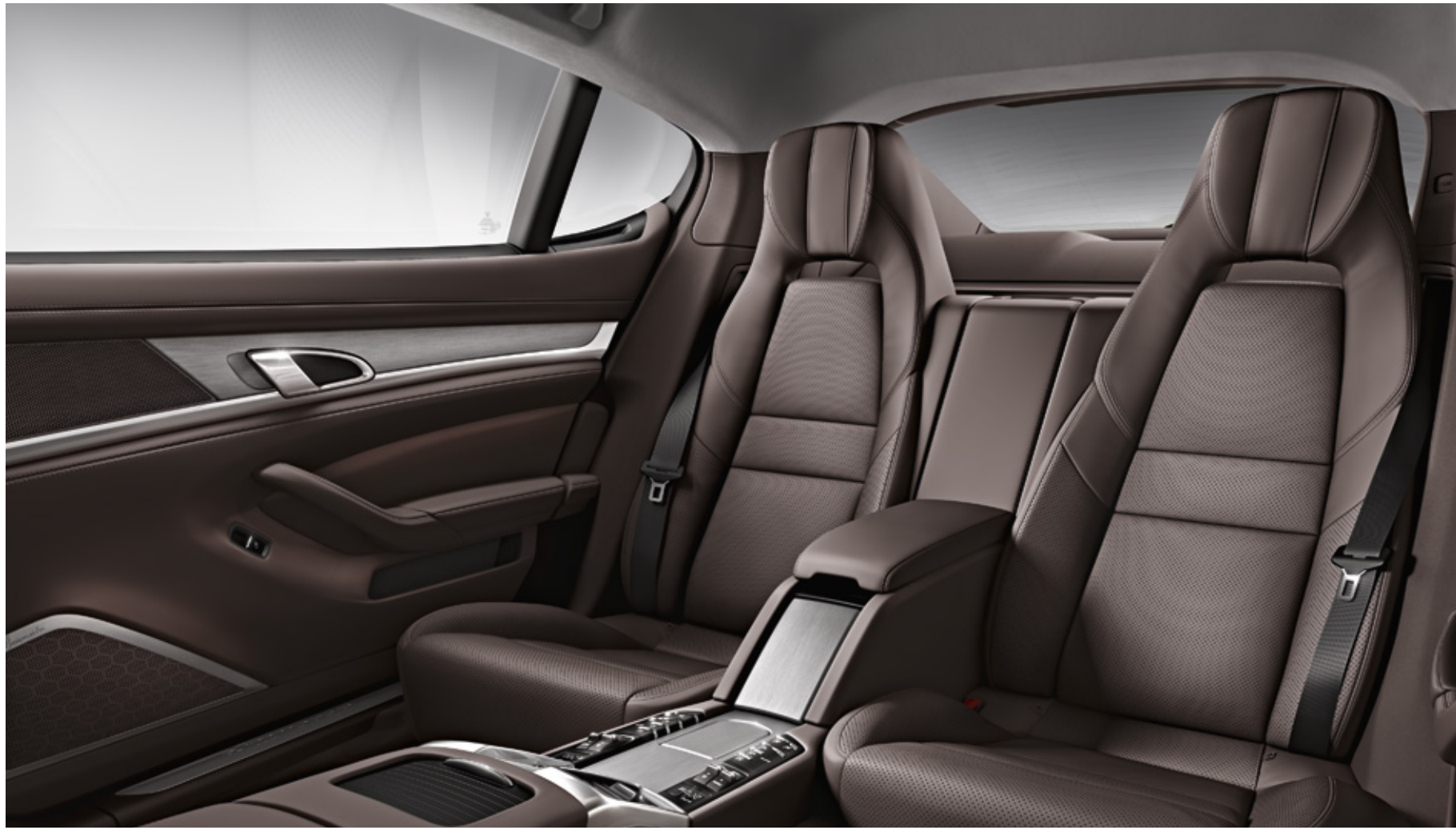
8-way power seats (rear) (in conjunction with large center console), with comfort headrests