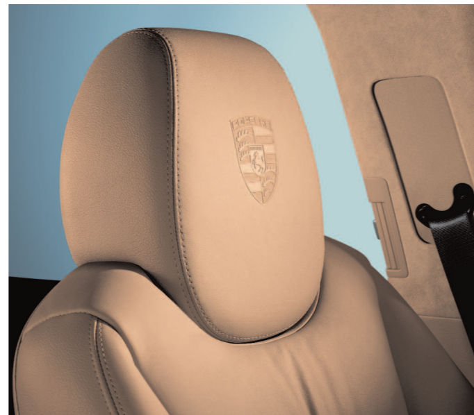
Porsche Crest embossed on head restraint