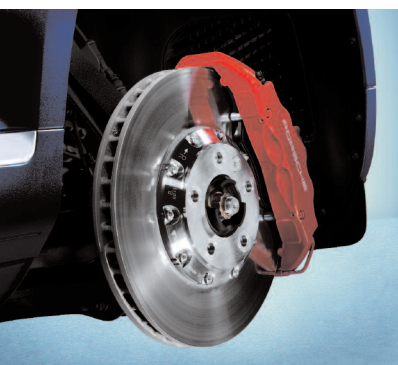
Brake disc and caliper