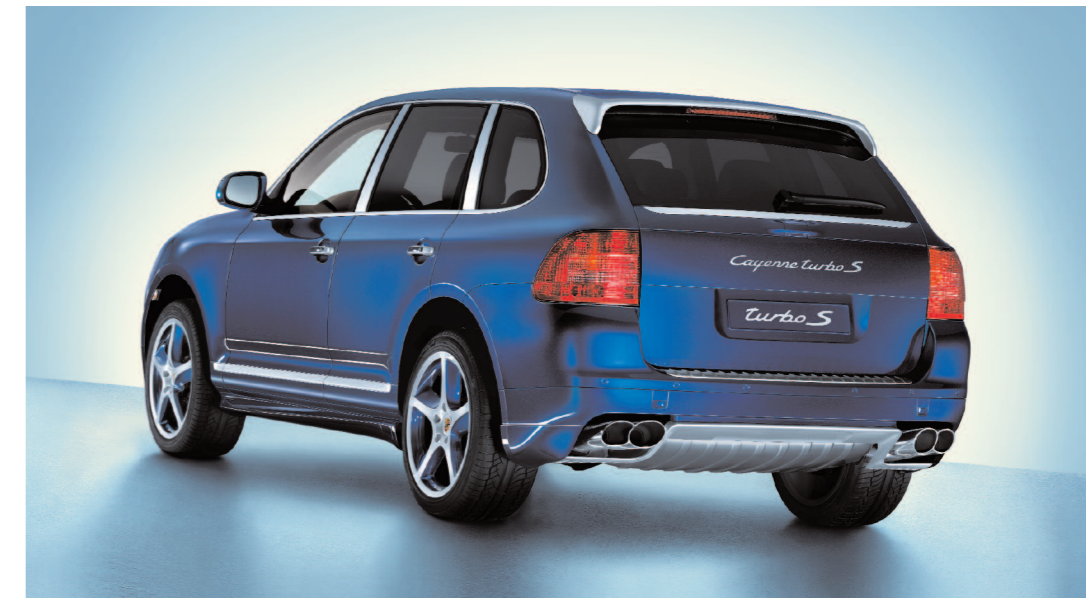
Rear view with SportDesign pack and 20-inch Cayenne SportTechno wheels in exterior colour