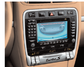
Reversing camera display in PCM