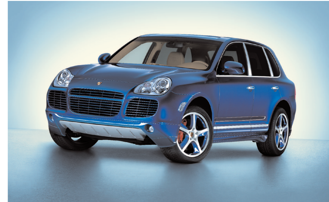
Front view with SportDesign pack and 20-inch Cayenne SportTechno wheels in exterior colour