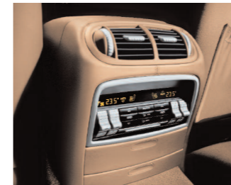
Four-zone air-conditioning system