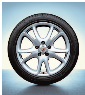
20-inch Cayenne SportDesign wheel

Front brake ventilation has been further enhanced with the aid of specially developed cooling air ducts. The rear brake units feature four-piston monobloc calipers with internally vented discs. The rear disc diameter is 358 mm – increased from 330 mm on the Cayenne Turbo – with an unchanged thickness of 28 mm. These generous proportions enable measured control of the car's enormous engine potential.