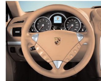
Three-spoke multifunction steering wheel in padded leather