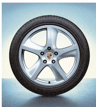
20-inch Cayenne SportTechno wheel