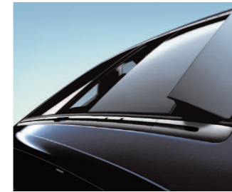
Panoramic roof system